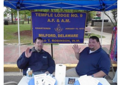
Master Mason degree by WM's of District 3, Gold Collar Night, Statewide Brother Bring a Friend Night, and Bug and Bud Festival – WOW, April was a busy month for Temple No. 9!!