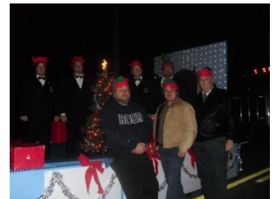
The Christmas parades in Harrington and Lewes were a huge success, we even won second place in Harrington!! As you can see everyone had a good time!!