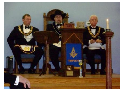
The Grand Master's Visitation was a great success with over 100 brothers in attendance at dinner and in lodge!! An accomplishment!!