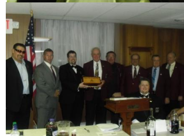
The Past Master's Night Table Lodge was great!! Everyone had a good time, many hands made for light work and the evening ended with the transfer of the District 3 Traveling Gavel!!